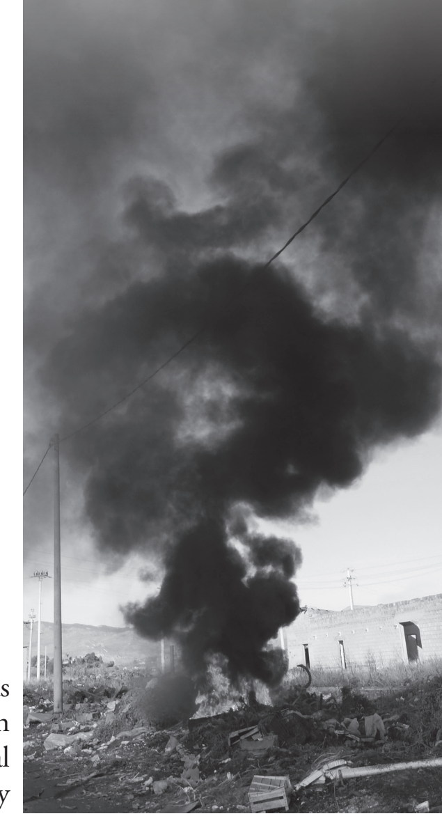
Texas Commission on Environmental Quality